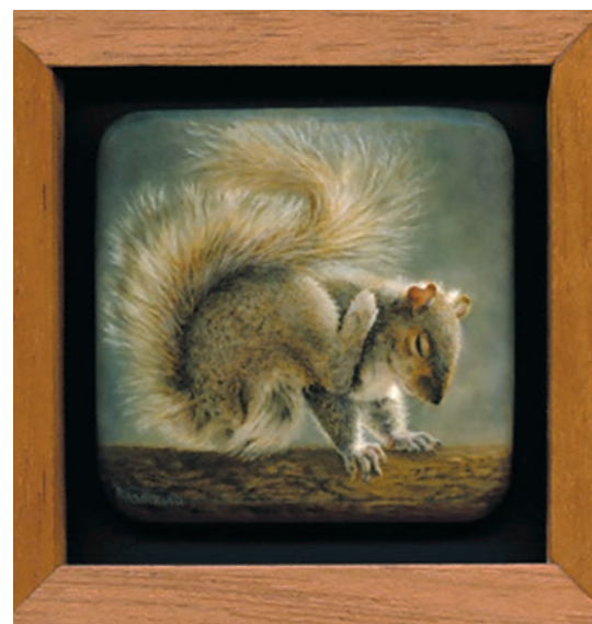
Celyne Brassard, Flea Market, oil/ lacquer